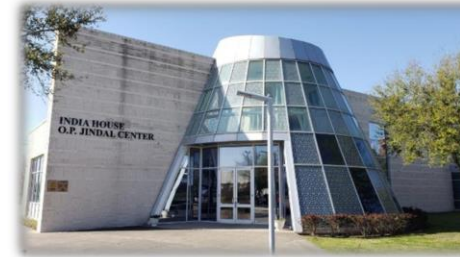
India House Video

India House, Houston 18888 W. Belfort Ave, Houston, TX 77031